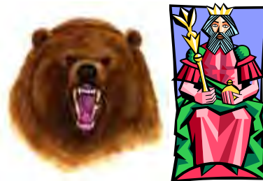
Bearing the King...