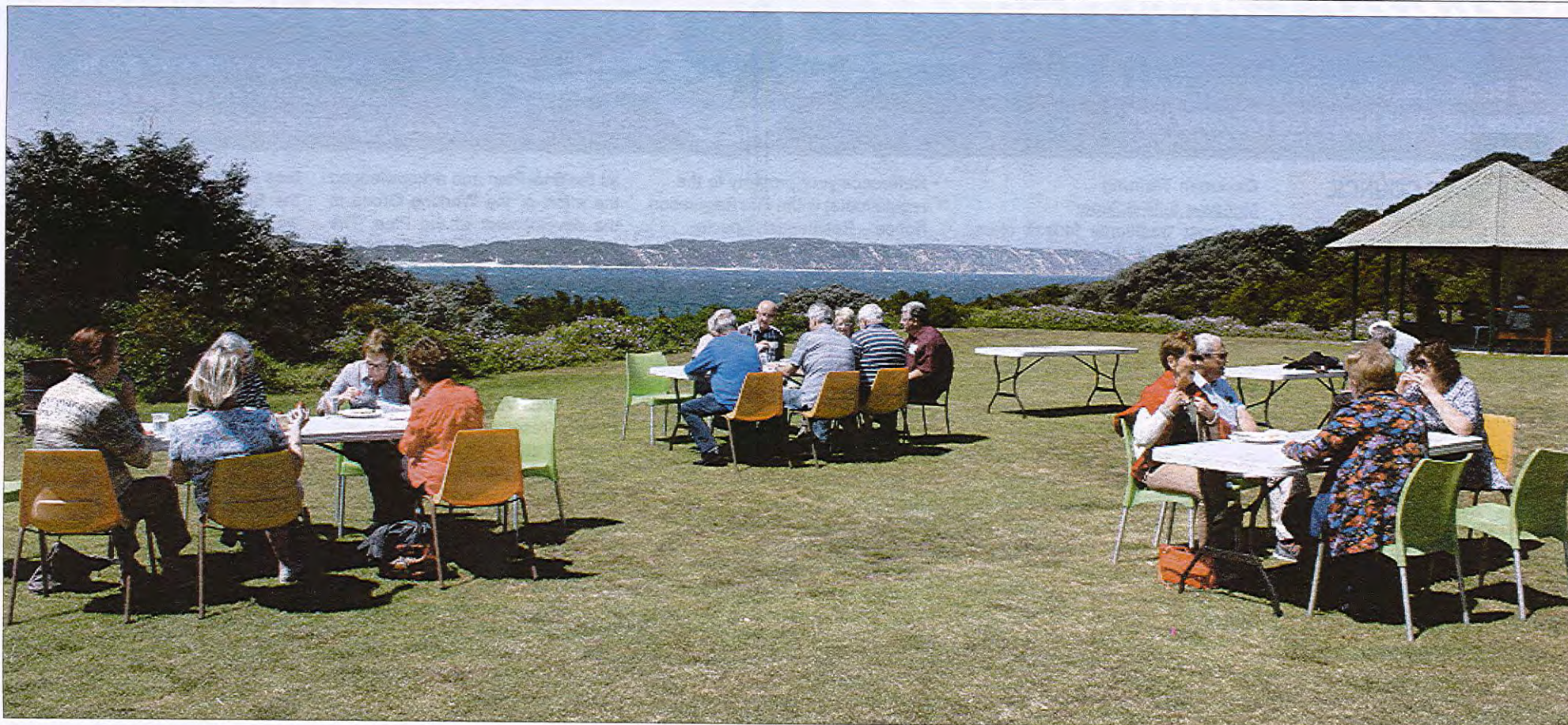
More than 100 bridge players from clubs throughout WA attended the Denmark Bridge Club's first congress at Ocean View.