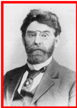
KING O'MALLEY Visionary

Friday 4 th October to Monday 7 th October 2013